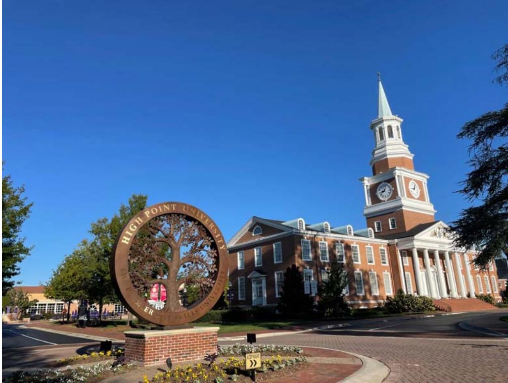
Figure 2. High Point University