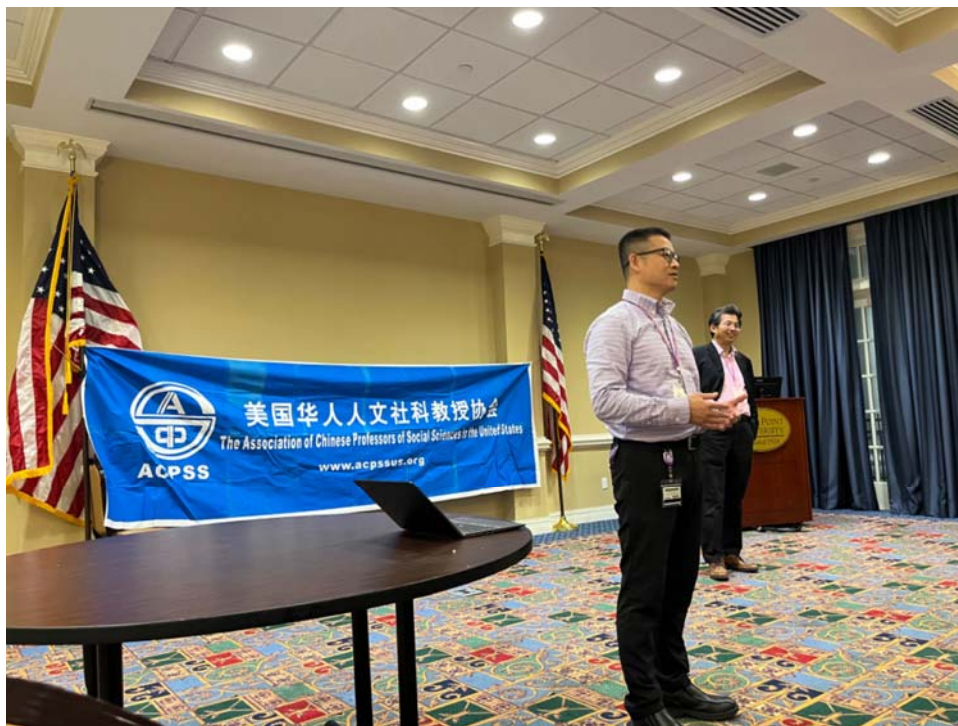
Figure 3. Opening Ceremony