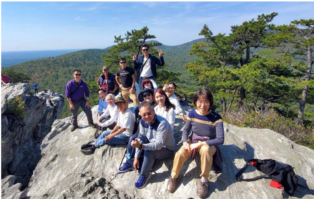
Figure 8. Hanging Rock State Park

During the conference break, participants enjoyed a hiking tour at Hanging Rock State Park, taking in the stunning autumn scenery. We look forward to meeting again at next year's ACPSS conference.