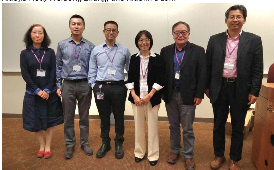
Figure 6. Board members and Asset Management Committee members